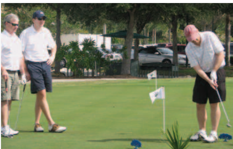
Lining Up a Straight Shot